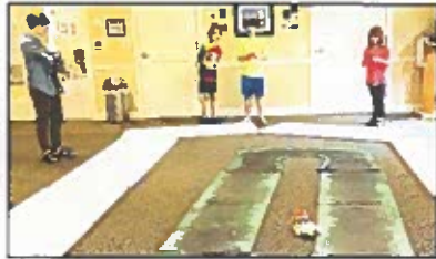
We had a Super Mario Party

Topsham Public Library was one of my favorite places when I was a kid. My parents took me several times a week, but I would have gone every single day if I was able to. As an avid reader, I got new books each time, and the staff let me talk about what I had read recently. They extended their kindness by giving me book recommendations, listening to me, and cultivating a space where I and other kids could learn. I hope that kids continue to visit TPL and grow up in a positive and encouraging environment just like I did.