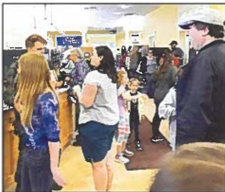
It seemed like the whole town came to our party!

It was wonderful to see so many of our community members turn out for TPL's 20 th birthday party! I believe I can speak for all of our board members in saying that we serve on the board because we love our library, and it means a lot to see that love shared by so many Topsham residents.