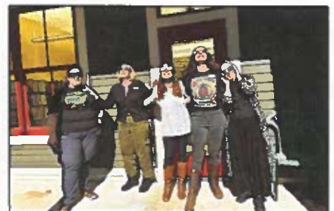
We gave away 500 pairs of eclipse glasses for the 2024 eclipse

Twenty years later, I'm watching a new generation of people make their own choices from the other side of the counter. I'm happy to be a part of a thoughtful community where we believe in the mission that a library is a place for all people.