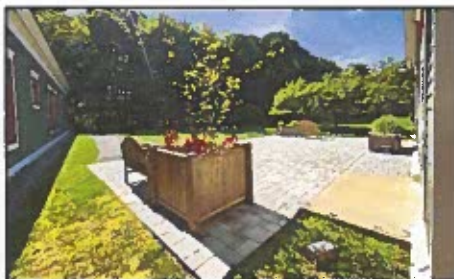
We added a rear patio for outdoor programs in 2016