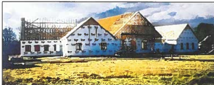
Building the building

In this year's annual report, you will find reflections and stories from staff, trustees, friends, and community members alike. There has been a lot to celebrate in the last twenty years and even more to look forward to experiencing in the future.