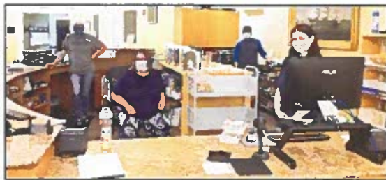
We were one of the first libraries to open to the public after the COVID shutdown

creativity, and connection. Personally, it's been a source of pride to be able to play even a small part. There have been many changes in the library in the past few years, new or evolving services, events, and staff, but the sense of community and connection has been a touchstone that is an integral part of everything that TPL touches. As we continue to change and adapt to our community's needs, I look forward to our next twenty years.