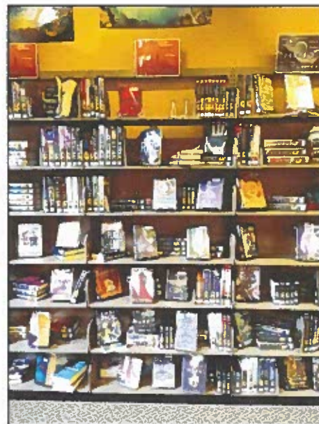
New dynamic shelving in the teen room

Over the last few years, I feel the teens have been slighted. I have done my best to fulfill the role of teen librarian, but I am also the assistant director, and the time I have to dedicate to teen services has steadily declined. If I could write the next chapter in the story of teen services here at the Topsham Public Library, it would include a staff member dedicated solely to teens. Our teens are a valued part of our community and deserve to have someone whose main focus is providing services for them. As I reflect on my 20+ years of teen service here at the Topsham Public Library, I would like to express my deepest gratitude to all the teens who have trusted me enough to let me into their lives; it has been an honor.