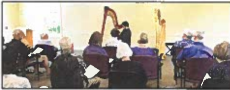
Students from the Bowdoin International Music Festival played for us

Even though I wasn't born until after the start of the new Topsham Public Library, the building is now a home away from home that has seen me grow up! I started going there before I could remember and soon grew accustomed to immediately running to the movie rack to look for the newest DVD of Backyardigans while my mom picked out my picture books for me. DVDs turned into looking for the next Babymouse or Raina Telgemeier graphic novel, then to my first steps into the teen room. Sooner or later, Covid dropped in, but that didn't stop the library from providing my family and me with our weekly book pickings. Now, I have the honor of being on the library board. Looking back as a senior, I realize just how much the Topsham Public Library has been there, growing along with me through life, and it is something I'll always have with me in years on as a community-seeking reader.