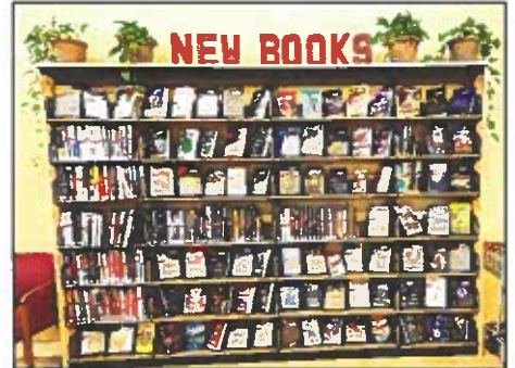
Your next book is always easy to find

keep evolving to meet the changing needs of our community. We hope that you will join us in making the next twenty years as successful as the last. Thank you for all you do to support the library.