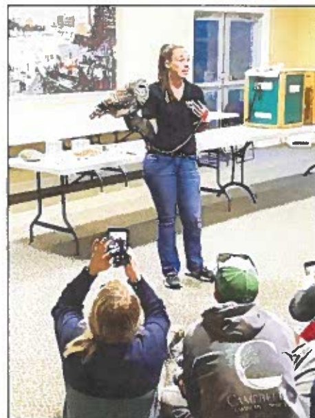
Chewonki Owls came to visit

We had 5,759 attendees at 219 children's programs this year